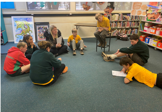
Yr 7-8 Focus Group