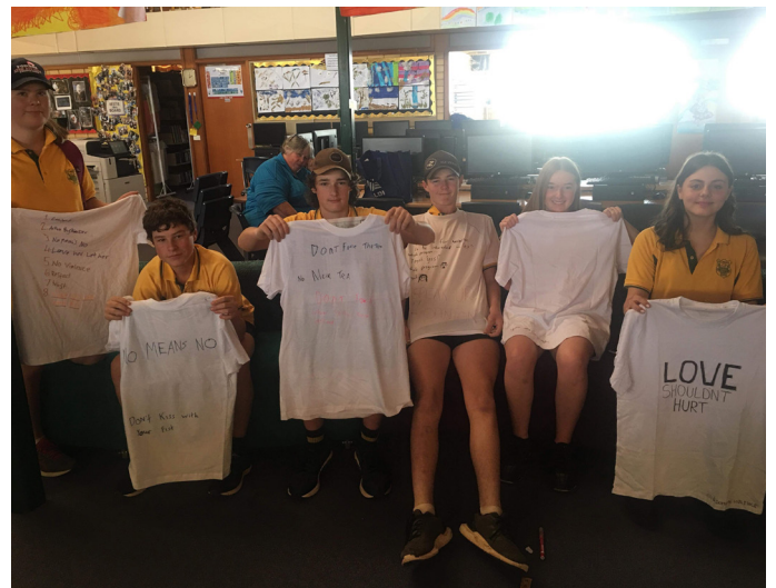
YR 9/10 LoveBits