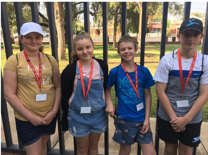
YR 7 ASPIRE

This Friday all student will be heading to Lake Cargelligo to take part in the NAIDOC day celebrations with surrounding schools. All students will be heading to Lake Cargelligo on buses and should be returning within the school times. Please make sure your child's notes are returned to the school ASAP.