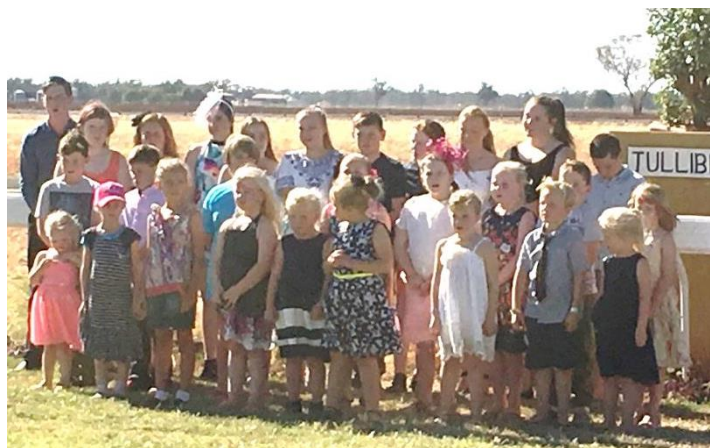
Students singing at the 2016 Picnic Races