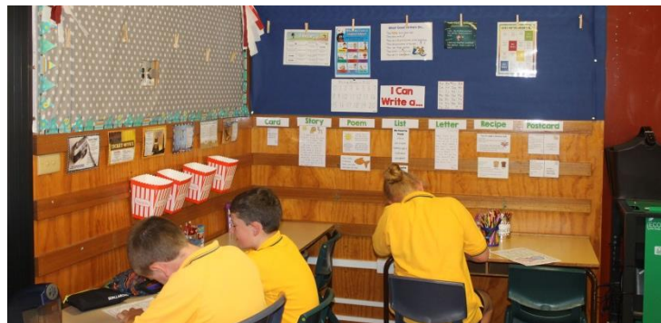
K/1/2 ROOM CALM BOHO