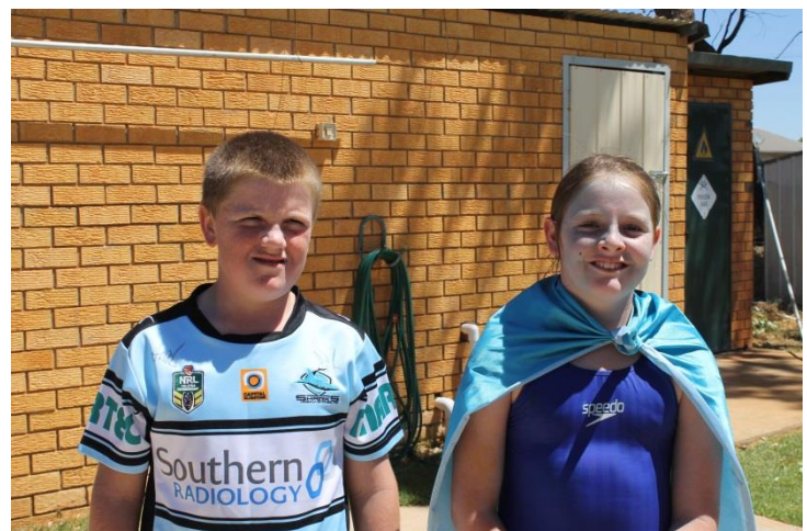
11/12 Years Primary Champions