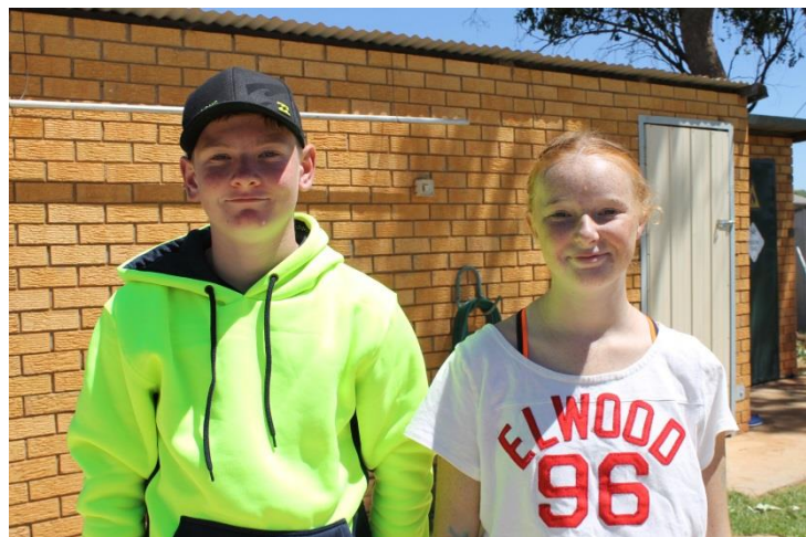
12/13/14 Years Secondary Champions