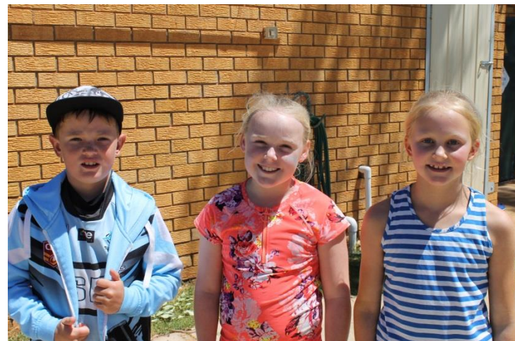
8/9/10 Years Primary Champions