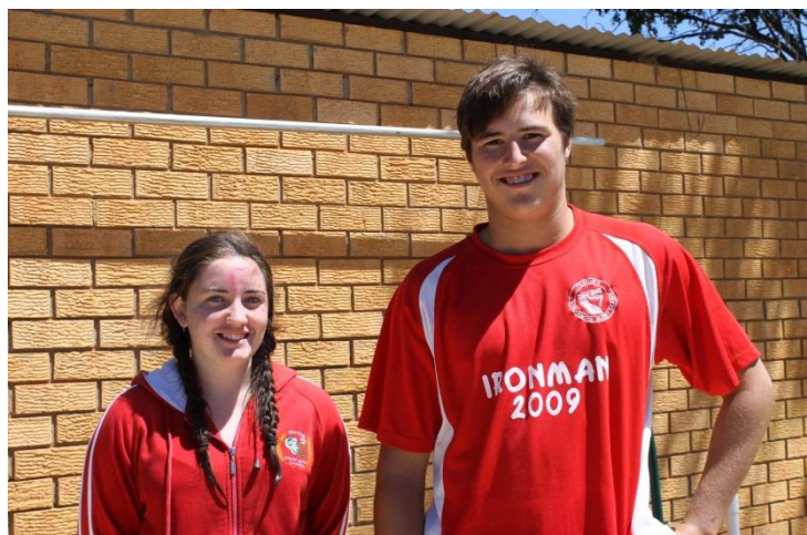
17/18 Years Secondary