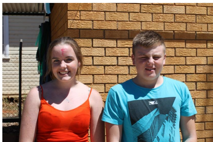
15/16 Years Secondary Champions