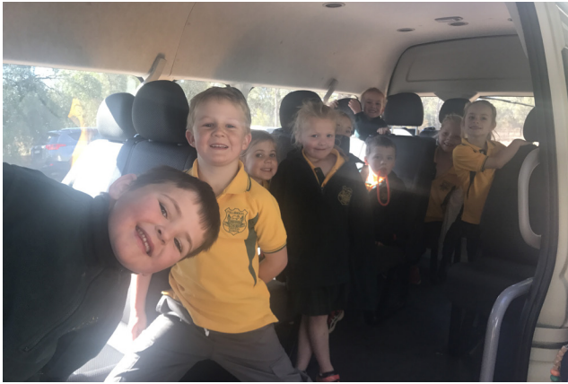
Kinder and Transition taking a ride on the School Bus