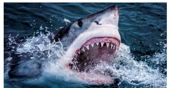
By Emma, Alyssa, Jack and Dakota

These super swimmers are the largest predatory fish on our planet. They are big, fast and can deliver a serious bite!