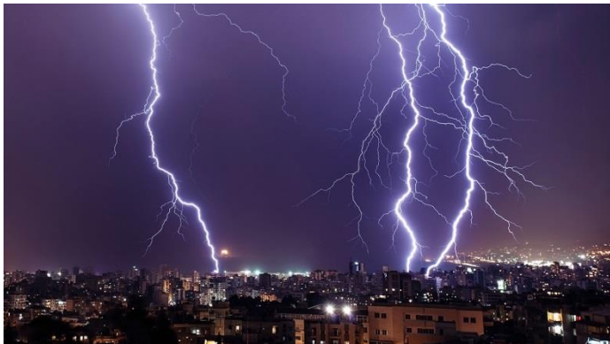
By Riley, Damon, Elly and Tahlia

The weather differs in Australia and around the world. It is unpredictable which means you have to be prepared to deal with emergencies.