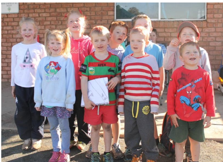
Age 5/6/7 student participation

Farrer team won the March on the day and Macarthur team won the carnival. Congratulations to all the age winners and everyone who attended and participated on the day the carnival.