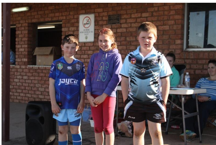
Age 8/9/10 Junior Primary Winners