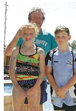
11/12 Years Primary Champions