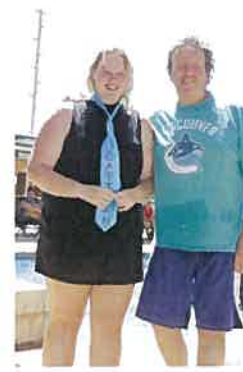
17/18 Years Secondary

It's good to see students settling into their schooling for 2015 and I would like to take this opportunity to encourage their efforts and endorse that they should give of their best and arrive to class in a timely manner.