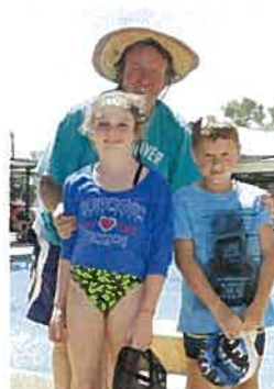
8/9/10 Years Primary Champions