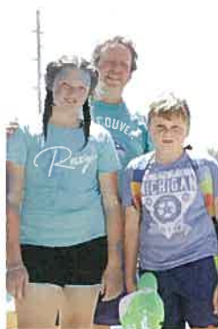
12/13/14 Years Secondary Champions