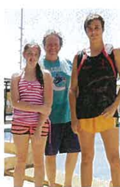
15/16 Years Secondary Champions