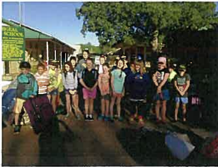
3-6 Borambola Excursion