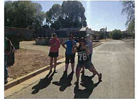
Some very sad parents!